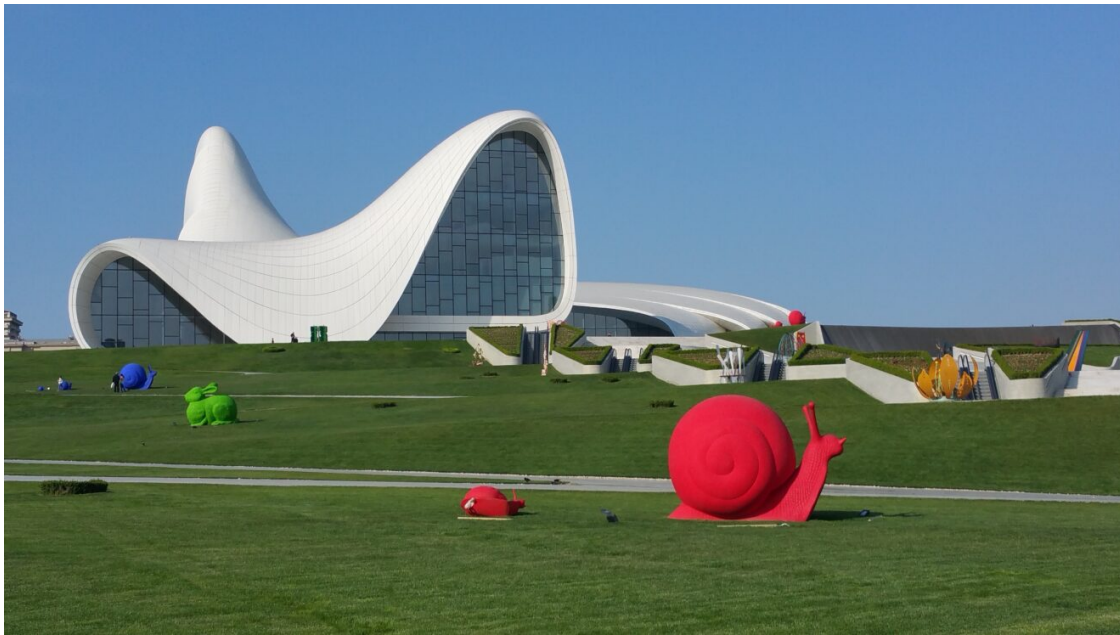
Aliyev Center, Baku

Azerbaijan is rich for its healing mineral waters. One of such resorts- Istisu sanatorium, located in Kalbajar region at an altitude of 2,225 metres was included in the list of all-union importance resorts during the Soviet period. At that time, about 50 thousand people were treated in Istisu every year and more than 800 thousand litres of mineral water were produced daily.